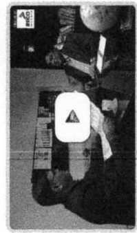
Type 'RIICO e-Auction' in YouTube