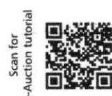
Scan for e-Auction tutorial