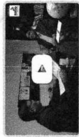
Type 'RIICO e-Auction' in Youtube