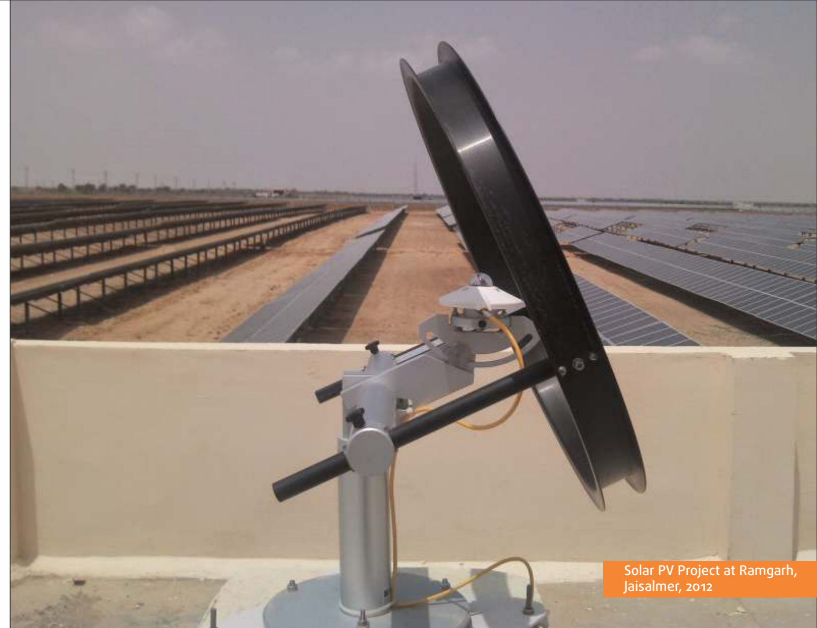
Solar PV Project at Ramgarh, Jaisalmer, 2012