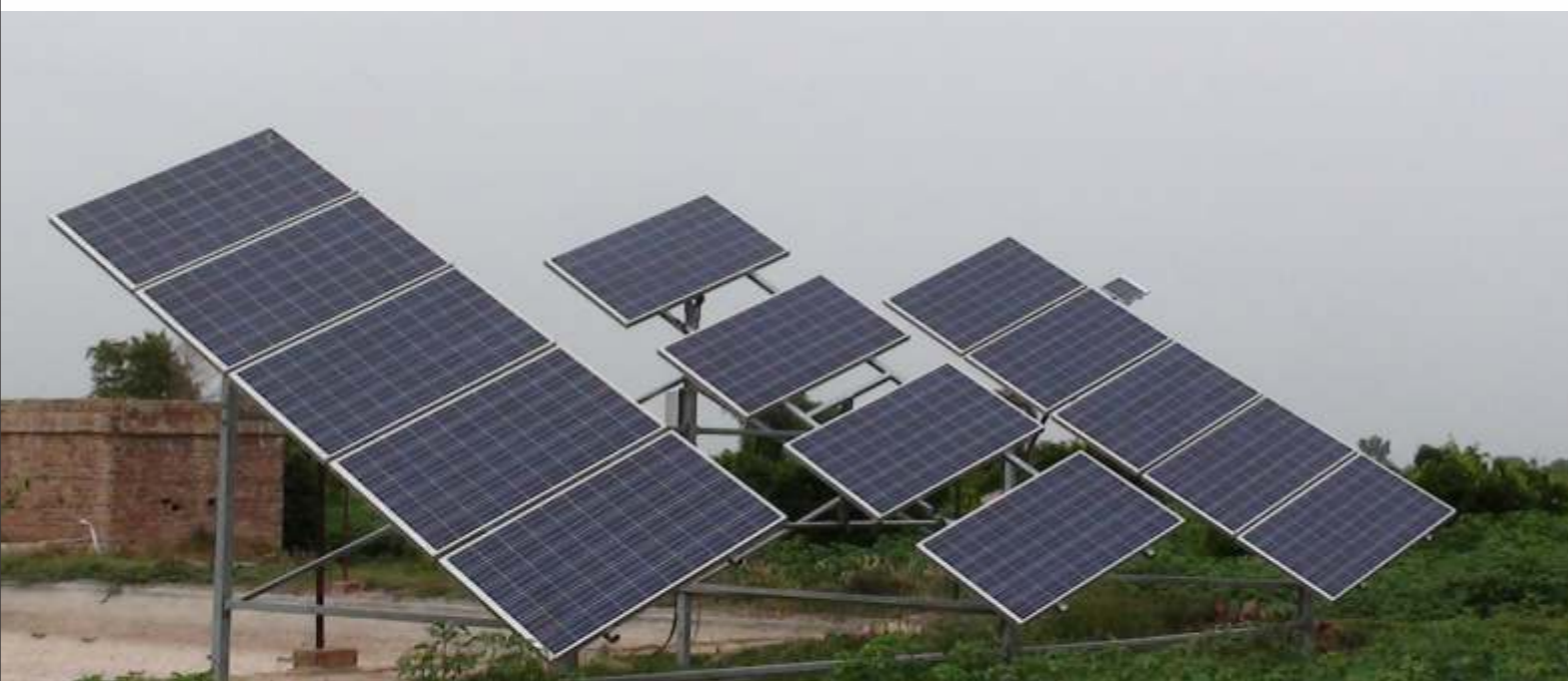
Solar water pumping set at Bassi, Jaipur