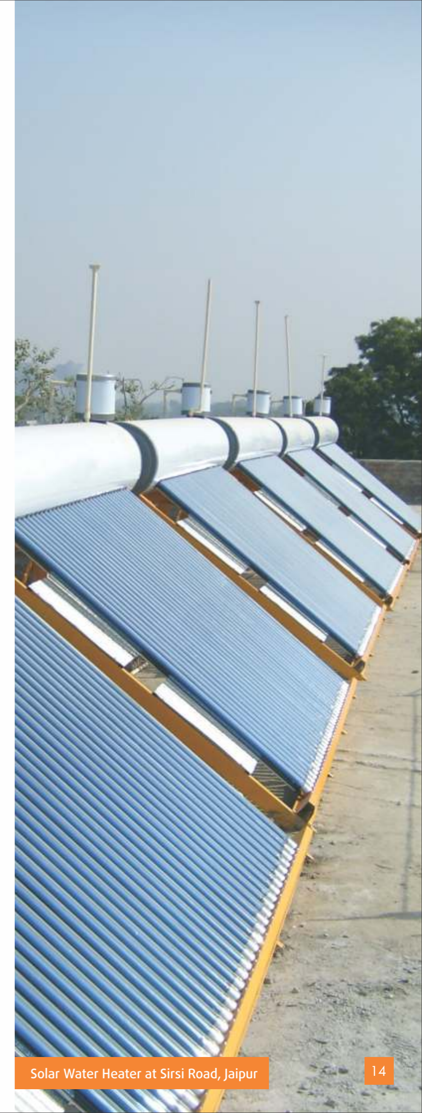
Solar Water Heater at Sirsi Road, Jaipur

17.3 Solar Power Producer to whom Government land is allotted will have to apply for final approval of the project within three months from the date of in-principle clearance by SLSC. If Solar Power Producer fails to apply for final approval of the project within the time prescribed, RREC will recommend for the cancellation of allotment of Government land with the approval of SLEC